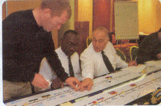
High command: experts plan Tube services

The maps and their counters (really Lego bricks in appropriate line colours) helped to translate the paperwork into practice.